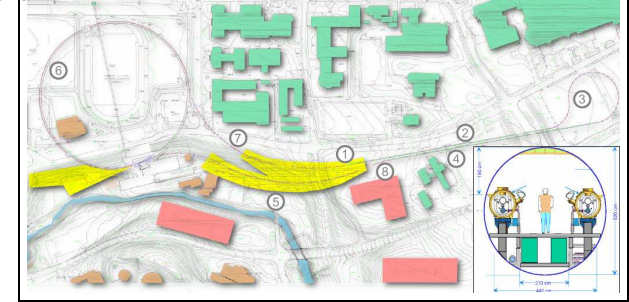
Figure 2: Layout of the planned 5GeV Cornell ERL.

The emittances in electron storage rings are determined by the optics of the ring and not by the quality of the injected beam. This is due to the stochastic nature of the emission of synchrotron photons in every bend of the ring, which randomizes the motion of electrons over many turns and makes the equilibrium beam distribution independent of the injected distribution. Linear accelerators do not suffer this emittance dilution and could thus accelerate very small emittances. Beams with emittances that are smaller