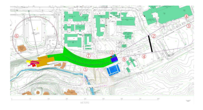
Figure 1: Current layout of Cornell's x-ray ERL.

The layout of Cornell's ERL is shown in Fig. 1. Several features have been developed further since the project description at [1]. An injector linac (1) produces 10-15MeV, 100mA beam with 77pC per 2-3ps long bunches for linac A (2). The beam is sent into a 2820GeV Turn Around (3) and is accelerated in linac B (4) to 5GeV for x-ray experiments in the undulator section (5). The beam is then returned through CESR (6) and the North undulator section (7) to linac A for deceleration, followed by a second Turn Around (8) at 2190GeV and by linac B, leading to the 10-15MeV beam dump at (9). This ERL is an extension to the