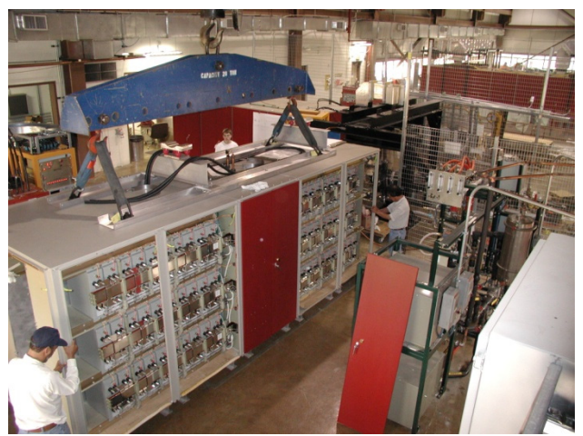
Figure 3: Completed NuMI horn power supply.