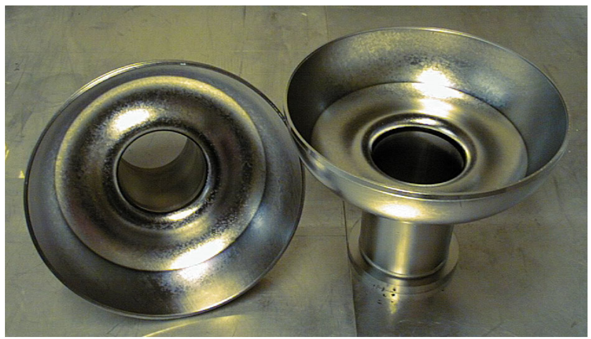
Fig. 2. 1300 MHz re-entrant cavity cups.