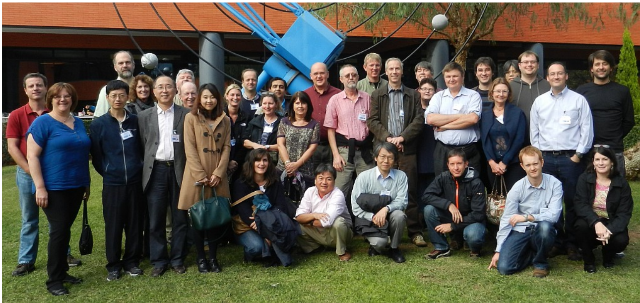
Figure 2: Example of a full-width figure showing the JACoW Team at their annual meeting in 2012. This figure has a multi-line caption that has to be justified rather than centered.

in 12 pt upper- and lowercase letters. The name of the submitting or primary author should be first, followed by the co-authors, alphabetically by affiliation.